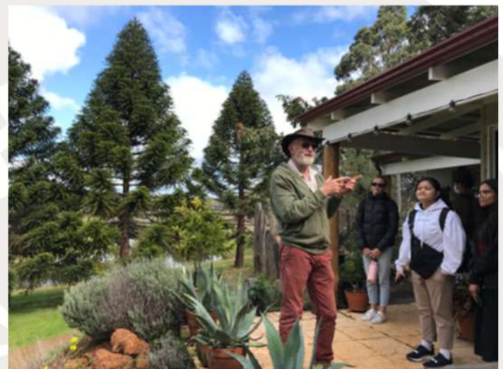
International Students Tour at Chestnut Brae