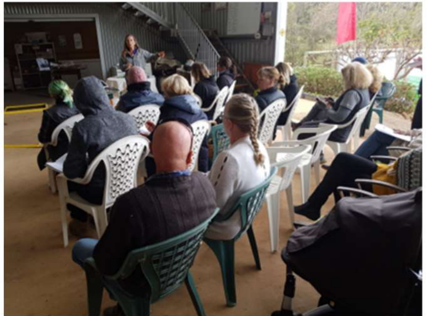
Medicinal Herb Workshop at Chestnut Brae