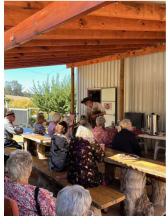
Outside Seating area- Food Tasting