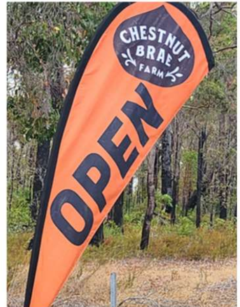
Entry sign by main road