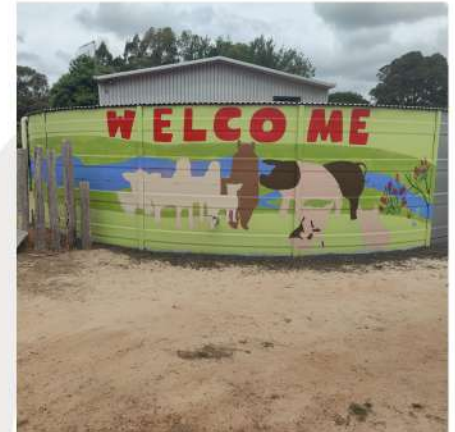
Welcome sign near car park