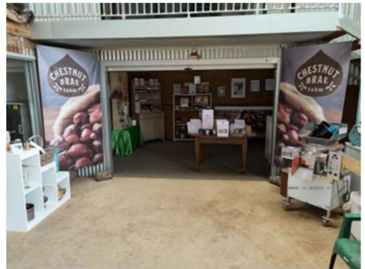
Signage at the entry of the farm shop from the shed

In addition, the following further information can assist guests: