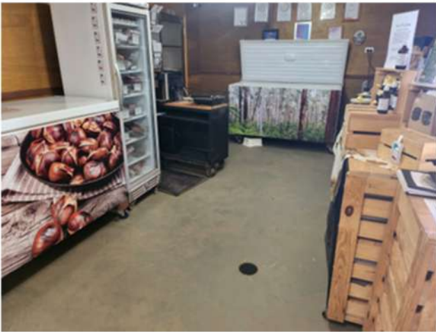
Inside the Farm Shop