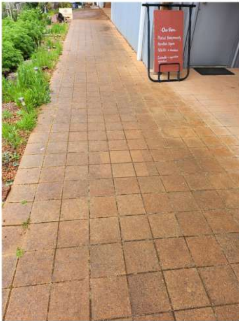
Path to shed

When providing talks we use a mike and speaker system for large group presentations