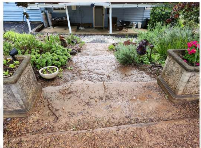
Steps down to Farm Stay