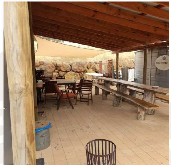
Outside Seating area

In addition, the following further information can assist guests: