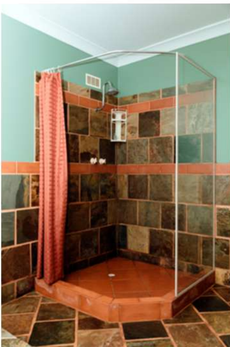
Farm Stay Bathroom - Shower