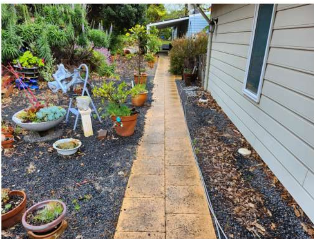
Alternative path to Farm Stay

The farmstay is not suitable for less abled guests. It is a 100 year old building with different floor levels