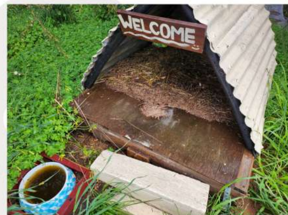
Secure Dog shelter and water

Dogs are not able to go through our orchard area, due the organic accreditation requirements. However, service dogs are able to assist in the shed and garden areas. The garden area is sloped gravel, this is something for those with visual impairments to be aware of.