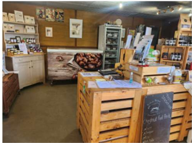
Shed Entry of the Farm Shop