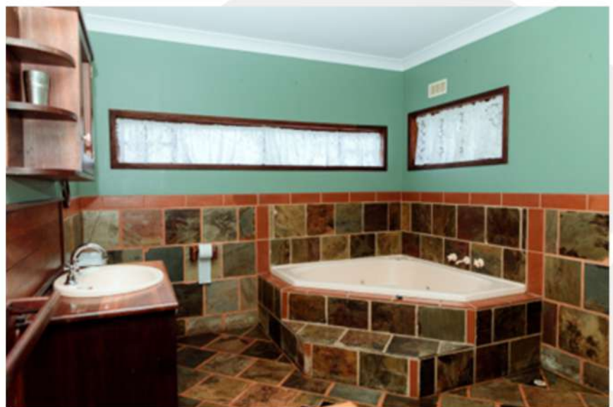
Farm Stay Bathroom - Bath and Basin