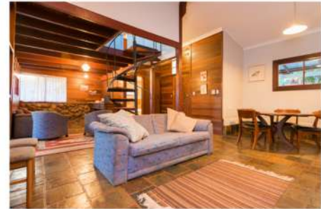
Main area of Farm Stay

In addition, the following further information can assist guests: